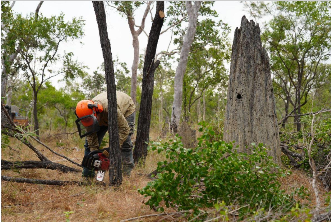
Practical conservation actions in critical Golden-shouldered Parrot nesting habitat.

July was a very busy month, with the first large areas of parrot habitat receiving treatments that will restore their natural open structure. We removed shrubby overgrowth near conical termite mounds, within which the parrots excavate their nests. With these shrubs now gone, we expect future nesting attempts to be more successful because predators no longer have the cover to sneak up and launch an attack. The photo above shows project member Andrew Lilly removing quinine shrubs from near a nest that was active earlier in 2021. Unfortunately we may have been too late for the owners of this particular nest... we found tail feathers belonging to an adult male Golden-shouldered Parrot right next to the nest entrance. Hopefully he managed to escape an attack with just losing his tail. This observation underscores the urgency of our work. We need ongoing support to clear around as many nests as we can within the shortest time possible.